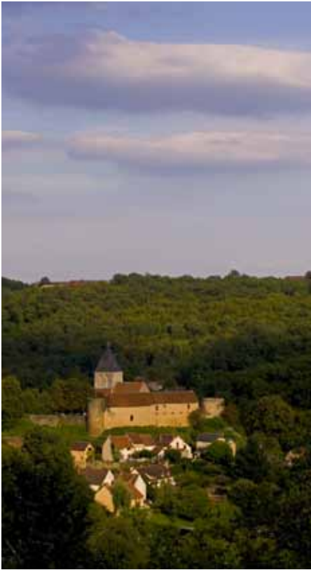
Gargilesse