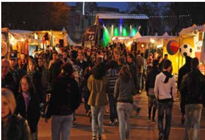
Printemps de Bourges