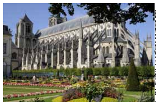
Cathédrale de Bourges