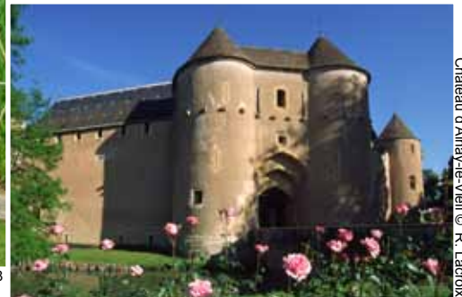
Château d'Ainay-le-Vieil