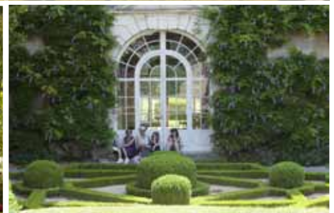
Château d'Azay-le-Ferron