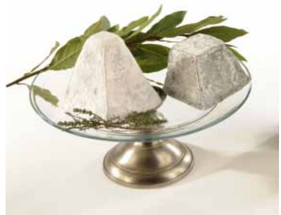
Valençay & Pouligny Saint-Pierre

The A.O.C. of Chavignol produces a very celebrated goats' cheese crottin. Pouligny-Saint-Pierre and Valençay also form part of the culinary heritage and their cheeses owe their unique flavours to the local breed of red goats, the richness of the pastures and the skills of the cheese-makers. According to local legend, Valençay goats' cheese was traditionally shaped in the form of a pointed pyramid, like its cousin from Pouligny-Saint-Pierre still is today. Monsieur de Talleyrand, who attached great importance to the quality