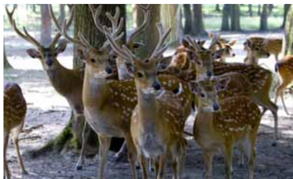
Réserve de la Haute-Touche

Nearby, in the Haute-Touche Park, more than a thousand animals roam freely within the 180 hectares available to them. Three and a half kilometres of footpaths offer superb opportunities to observe wolf, wild boar, llama, zebra, yak, bison and antelope. The fauna is completed by a rare collection of deer as well as forty species of bird. The reserve is home to many threatened species that can be observed on foot or by bike through the park paths.