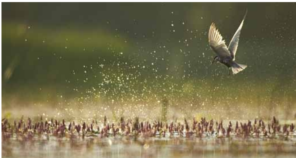
Guifette Moustac