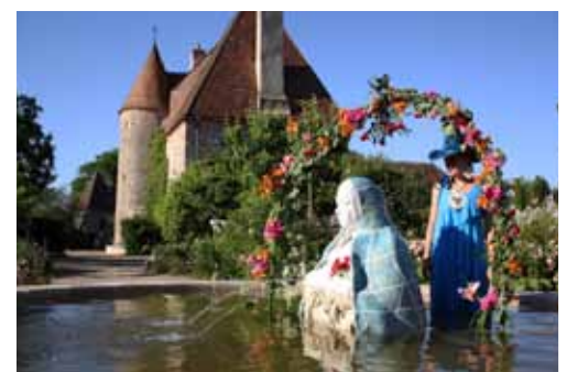
Jardins de Drulon

Six beautiful gardens and an exciting path through the rich Berry landscape are forming the exceptional background of an exhibition of contemporary art renewed each year. A stunning collection of tree peonies, roses, hemerocallis and dahlias. Interesting from spring up to fall.