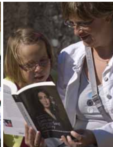
Lecture chez George Sand