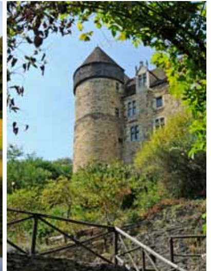
Château de Culan - Route Jacques Coeur

Born around 1400, Jacques Coeur, a small merchant, became, within the space of ten years, a major international trader. He dealt in spices, silk and arms with the countries of the Middle East and Northern Europe. He also became the Finance Minister of King Charles VII who eventually took umbrage at the extent of his powers. Thus Jacques Coeur fell into disgrace and all his belongings were confiscated. The Jacques Coeur Palace, which he had had built for his personal use, remains the jewel in the crown of Berry monuments. In memory of this illustrious ancestor, this route brings together 18 different sites and monuments (privately-owned châteaux, museums, ancient historical sites, abbey...) from which Aubigny-sur-Nère village and Château de la Verrerie are notable for their ties with the ancient kingdom of Scotland.