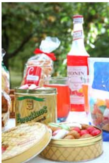
Spécialités sucrées du Berry

The Berry "savoir-faire" is also in hand-made sweetened specialties. Georges Forest, a talented confectioner from the Berry, invented the first filled sweet in the world in 1879. Crunchy and soft at the same time, he christened it the «forestine». At the heart of the old town of Bourges, La Maison des Forestines opened its doors in 1884. Another sweet delicacy of the Berry are the sablés de Nançay, little pure-butter shortbreads. Finally, the Croquets de Chârost, delicious almond biscuits, are typical of the Berry as are the famous massepains d'Issoudun, Balzac's favourite dessert. All these specialties can be savoured with Monin range of liqueurs. After discovering transatlantic cocktails, Georges Monin developed a new style of spirit to be drunk on the rocks in the American fashion. Far from being traditional liqueurs, they are highly original and distinctive, distilled from lime zest and tropical plants - so original that they remain unique and unchanged.