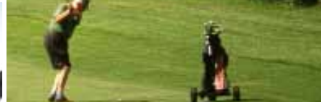
Golf de Sancerre

In the Berry, all leisure activities are available from the more traditional to the most modern and exciting - from bathing to climbing, water-skiing to parachuting, kayak to bungee jumping, horse-riding to golf.