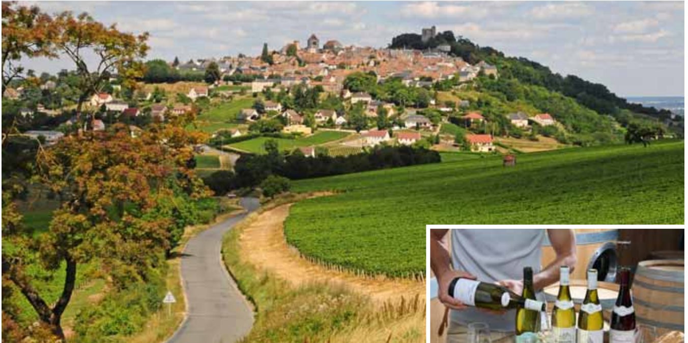
Vignobles de Sancerre