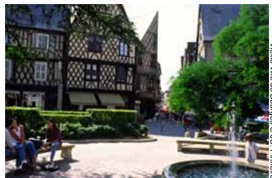
Vieille ville de Bourges

Dominating the town and its marshlands, the majestic Saint Etienne Cathedral has been on the UNESCO list of World Heritage Sites since December 1992 for its unique architecture. Capital of France during the time of Charles VII, Bourges became a busy commercial center in the 15th century and was graced with the elegant Palace of Jacques Coeur, one of the most beautiful privately-owned French stately homes of the 15th century. Five free-entry museums, the Hôtel Lallement, the Museum of the Best Artisans of France, the Estève Museum, the Berry Museum, and the Schoolhouse Museum, provide ample opportunities for discovering the rich history of the province. A city of light and music, Bourges puts on three grand annual pageants : le Printemps de Bourges, the «Summer in Bourges», and the «Illuminated Nights», a magnificent sound and light circuit that combines culture, tourism, and heritage.