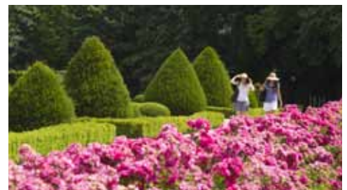
Jardins du Château de Bouges

Range from the traditional French style of very formal bedding schemes surrounding chateaux to smaller more relaxed planty schemes, Berry Secret gardens are displaying natural beauty. From an artistic garden to medieval and romantic natural settings, Secret gardens offer panoramic views of a generous nature combined with the inspiration and imagination of the gardens' owners.