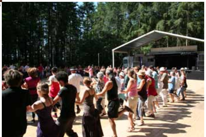
Festival des luthiers

This festival is the unmissable date for all lovers of instruments and traditional music. During the day, the visitor can enjoy the Ars Château Park and visit some 130 stringed instrument makers' stands on display and listen to the many different types of music. As night falls, the stage is home to an international performance. Specially constructed wooden floors around the château resonate with the sound of dancing.