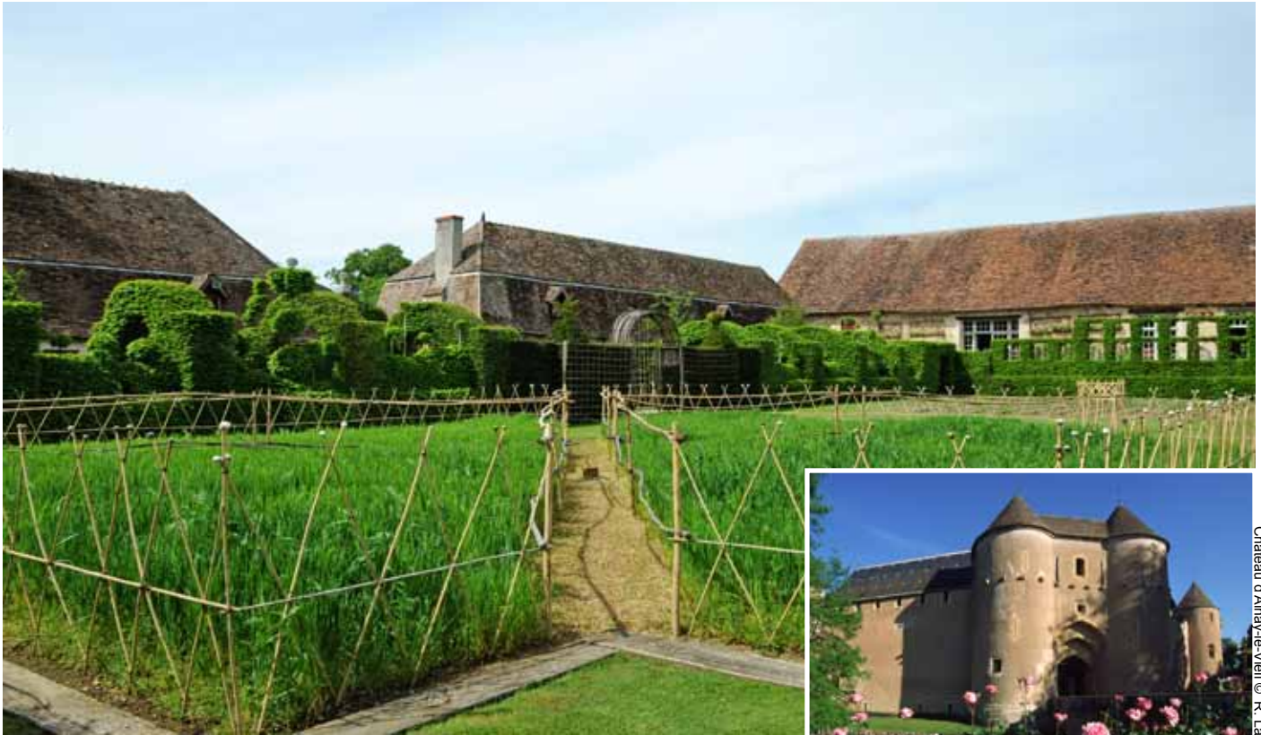
Jardins du Prieuré d'Orsan