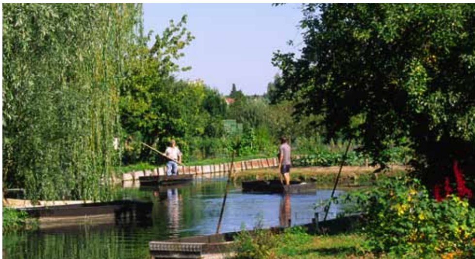
Marais de Bourges