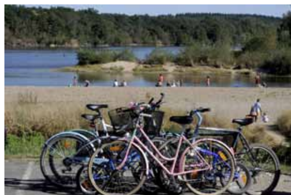
Loire à vélo

"La Loire à Vélo" is an itinerary that is being built section by section and which now covers about 800 km alongside the Loire and its tributaries. This cycling track can be use in full thanks to guidebooks, linking Cuffy (in Cher) to St Brévin-les-Pins (in Loire-Atlantique). In the Cher department, the itinerary is complete and starts at the Le Guétin canal bridge, near Le Bec d'Allier in the commune of Cuffy. A branch to La Guerche sur l'Aubois and its railway station and to Apremont sur Allier, ranked as one of the most beautiful villages in France, has been included. Cycling the Loire in the Cher department is a great occasion to discover beautiful features of the Loire Valley region : vineyards of Sancerre, châteaux and cultural heritage sites, beautiful natural landscapes and the delights of the Berry gastronomy.