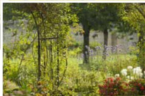
Jardins du Domaine de George Sand