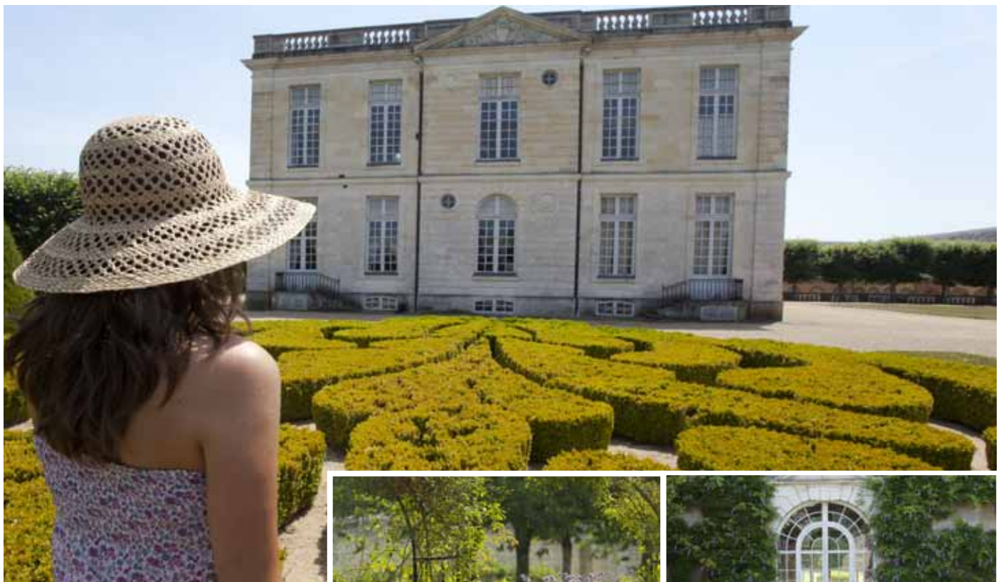
Château de Bouges