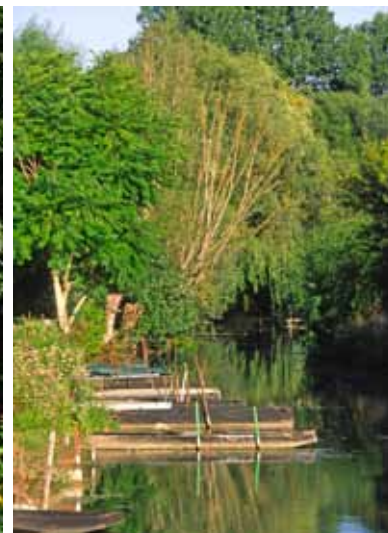
Marais de Bourges

At the very heart of the city, the swamps of Bourges constitute an enclave of 135 hectares of urban farming dating from the 12th century. The city of Avaricum was built on a promontary surrounded by swamps, which were used as natural fortification. In the 12th century, Carmelite Order, who owned some plots, began to clean these « foul and dangerous » greenfiled areas, to install mills instead. In 1618, the city, in need of grants, sold part of the marshes to a syndicate of land owners. Canals were built to clear land for farming. Gardening became the main activity which intensified until the 19th century. In the last century, with the profound lifestyle change, market gardening was slowly destined to disappear. Nowadays, gardening activity is recovering thanks to home gardeners. The swamps of Bourges have an excellent reputation thanks to the « Natural Heritage » classification (since 2003) that passionate gardeners help to maintain. These greenfiled areas are quite unique. Each garden has a specific setting, despite the graceful harmony of the place. Leeks, cabbage, carrots and beets are raised there in perfect order. Flowers and vegetables are mixed in an original and fanciful way. Wooden sheds, carefully surrounded by flowers, give to this green paradise a lively atmosphere.