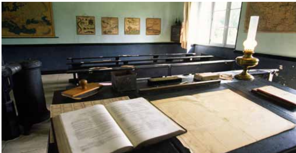
Ecole du Grand Meaulnes © R. Lacroix