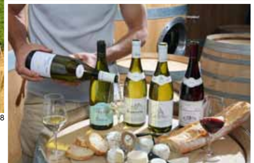
Vins du Centre Loire