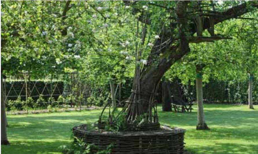
Jardins du Prieuré d'Orsan