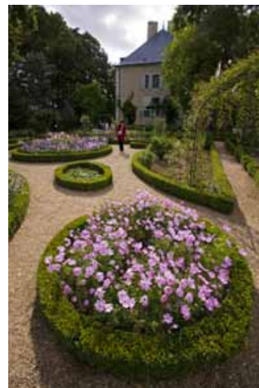
Maison de George Sand

Aurore Dupin, better known by the name of George Sand, inherited the Château de Nohant in 1821, after the death of her grandmother. In 1822 she married Baron Casimir Dudevant and had two children, Maurice and Solange. She started work as a journalist with the Figaro in Paris in 1831, after separating from her husband. Aurore Dupin became George Sand in 1832, a pseudonym she owed to one of her lovers, Jules Sandeau. Her first novel "Indiana" was greeted with success and started her literary career, opening the way to the great literary circles and salons. In her novels, she expressed the enduring love she felt for the lower Berry with its dark valleys and violet woodlands. George Sand was an original personality, audacious, a woman of letters, of politics, generous, feminist, ecologist, independent and rebellious to the end. In the Château de Nohant, a delightful country residence, little has changed since the time when George Sand entertained Chopin, Balzac, Delacroix, Flaubert and Liszt. All together show the Berry at its most romantic. Her study, her boudoir and her bedroom all celebrate her memory, as do the grounds where she was laid to rest in the small family cemetery. The George Sand's estate is open to visitors all year round. A tea room await visitors for a lunchbreak.