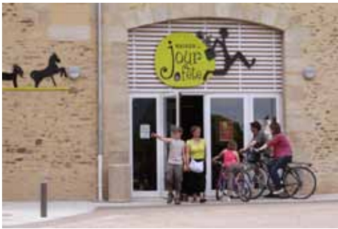
Maison de Jour de Fête

The celebrated film “Jour de Fête” by Jacques Tati was shot at Sainte Sévère, a pretty village in the Berry region. As a refugee, Tati settled nearby on a farm during the World War II. He promised the inhabitants to return and shoot his first feature, launching Tati's international reputation. The house of “Jour de Fête” takes the visitor back in 1947 to the village of Sainte-Sévère, transformed at the time by the arrival of a film crew for the shooting of “Jour de Fête”. Visitors will go over the event through the look of a child who retained the shooting memories by filming them with a coffee mill. To be seen with